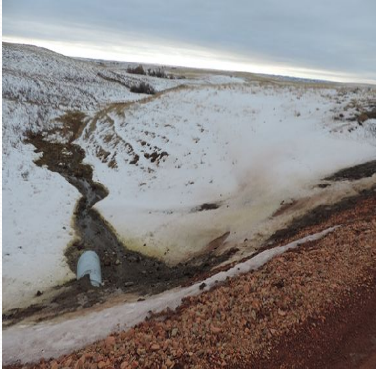
Illegal dumping in ND