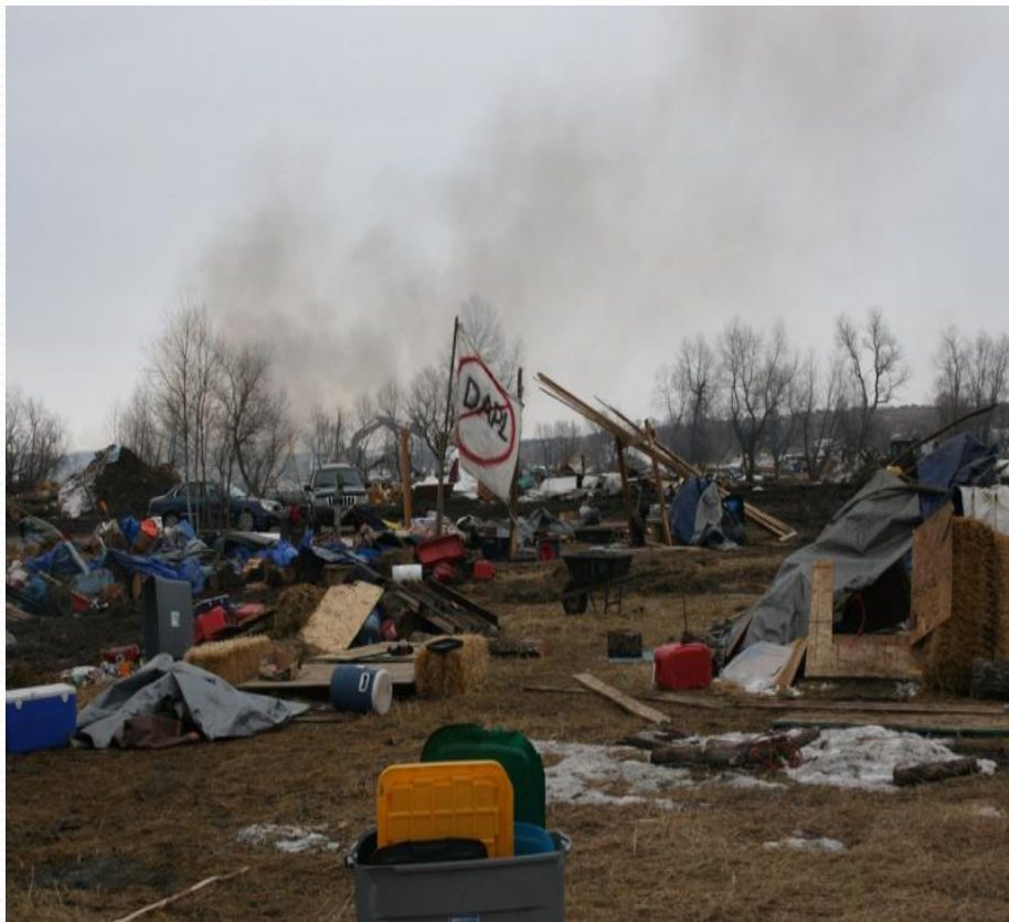
Oceti Sakowin Camp