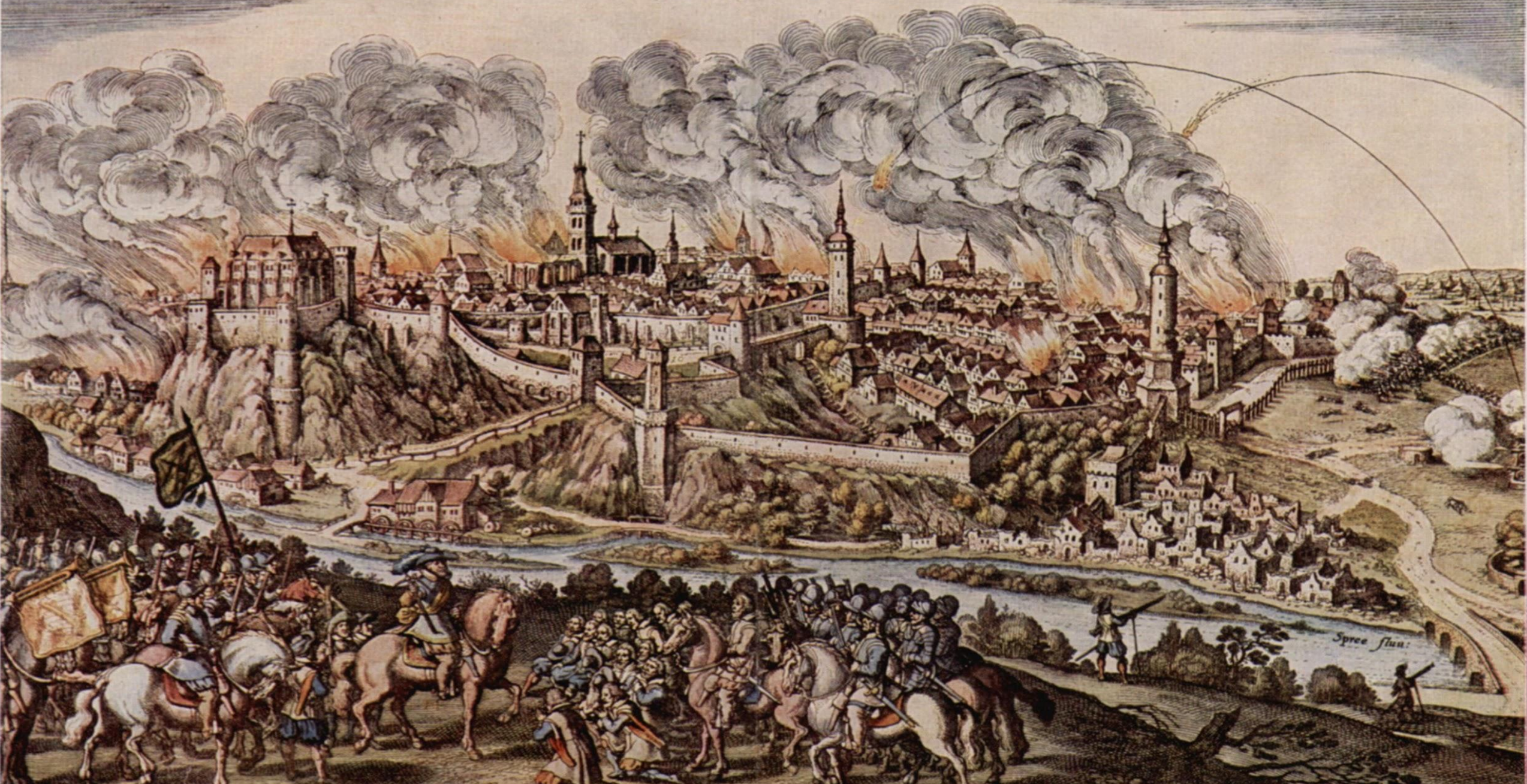
DELINEATIO BVDISSINI OBSESSI AB ELECTORE SAXONIAE AD OBSEQUIVM REDACTI MENSE SEPTEMBRI Anno 1620.